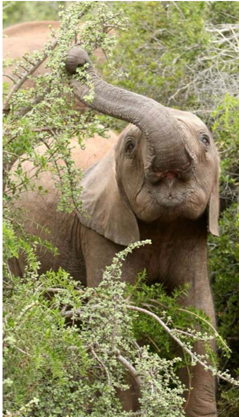
This elephant uses its trunk to get food high in a tree.

Elephants are herbivores (UR-beh-vores), or plant eaters, and they like many kinds of food. They eat grass, leaves, bark, branches, fruit, flowers, and seeds. Elephants are always on the move, looking for food and water. They eat so much that they can't stay in one place for very long. When they leave an area, the plants have time to grow back.