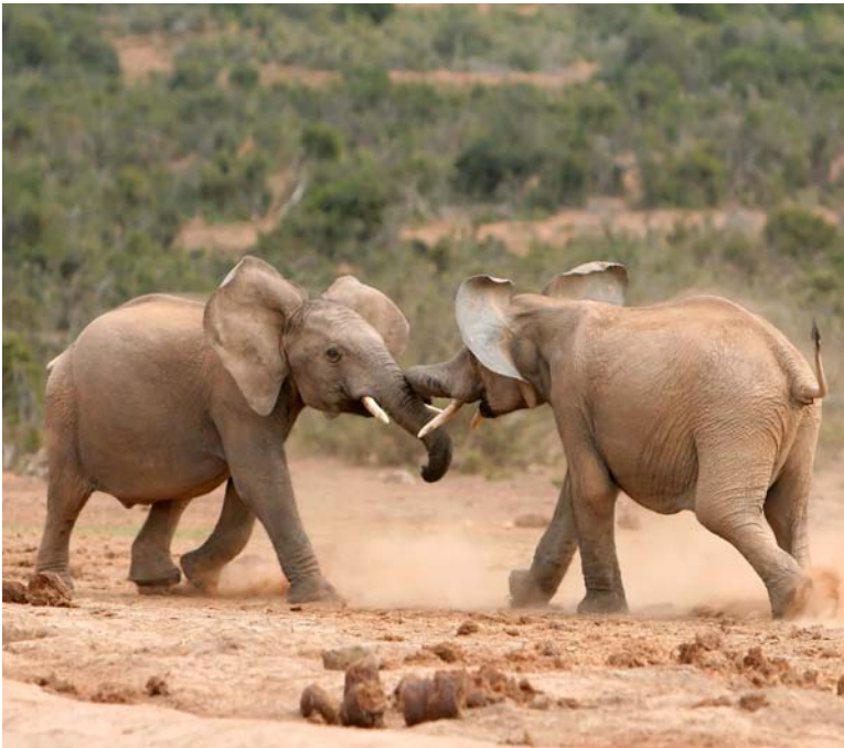
These male elephants are fighting.

Male elephants stay with their mothers until they are about 11 years old—teenagers, in elephant years. Then they go to live with other males. Adult males, called bulls, often live alone except when they mate with females. Sometimes bulls use their tusks to fight each other for a female.