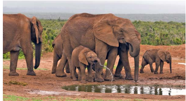
The matriarch of this family of African elephants will teach the young ones where to find food and water.