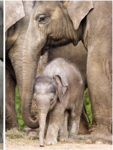
This elephant mom and her baby live in Asia.