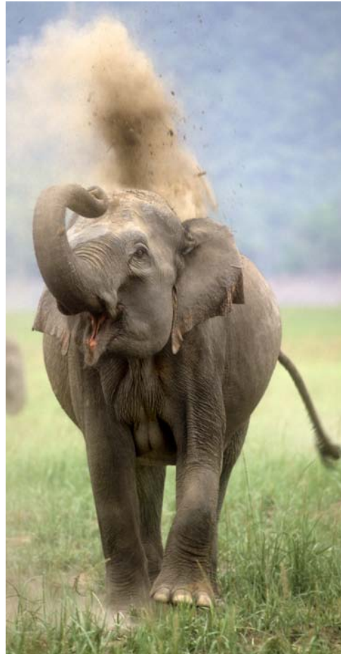
This elephant is giving itself a dust shower.

Elephant skin may look tough, but it's really very sensitive. Mud and dust help protect an elephant's skin from insect bites and the Sun's heat.