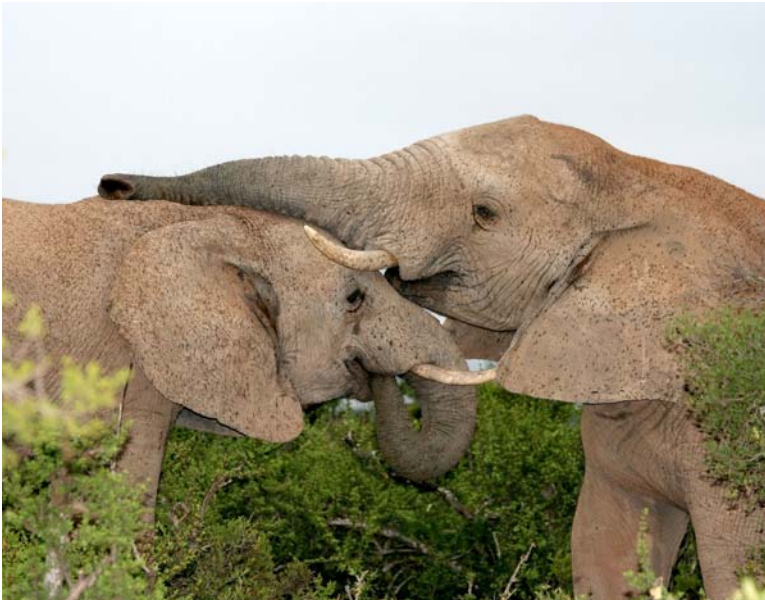
An elephant places its trunk on another elephant's forehead as a sign of friendship.

Elephants are amazing animals. I hope people can help these gentle giants stay alive for a very long time.