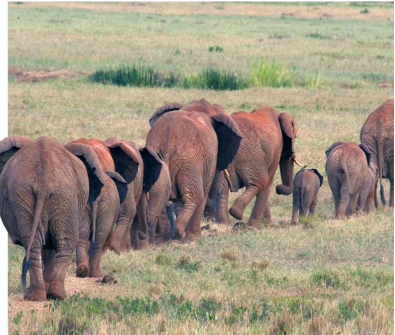
These elephants walk in single file as they move to a new area.

Sometimes three or more families of elephants join together to form a herd. A herd may travel together to look for food and water. Elephants often walk in single file with each family following its matriarch. They follow the same routes year after year as they move from place to place.