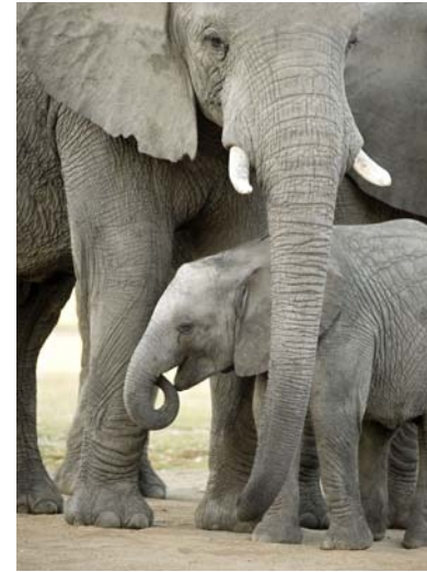
This elephant mom and her baby live in Africa.