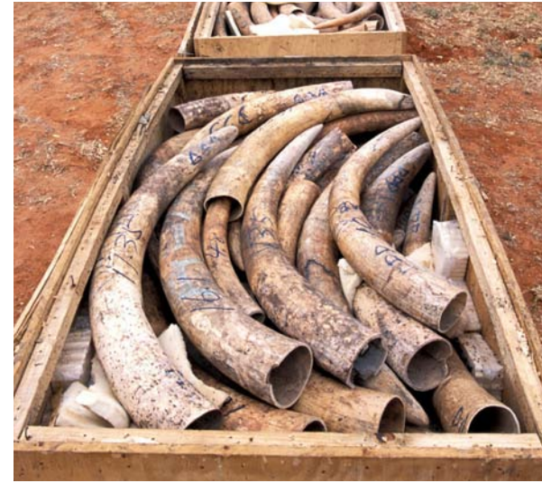
These tusks were taken away from people who broke the law and killed elephants.